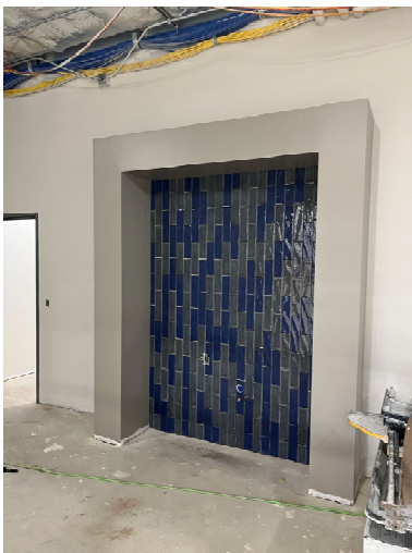
Decorative ceramic tile

Step by step, brick by brick, our vision for a new high school is steadily coming to life, evoking an excitement and pride with our students, staff and community. As we eagerly anticipate the start of the 2024-25 school year, we're thrilled to share the latest updates on the construction progress. As the building continues to take shape, we can see our designs come to life and are excited that our new high will be a beacon of cultural pride and educational excellence. Designed to honor our heritage, bring the natural world into our learning spaces and foster creativity; this project embodies the spirit of our community. Here are a couple areas of focus: